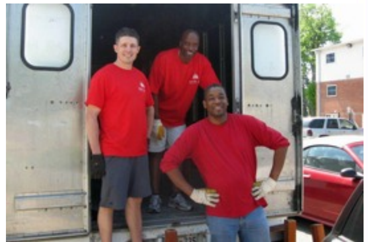
Volunteers representing Keller Williams Realty observed their "Red Day" by arriving early and staying late to work at Harford Family House on May 12th. They painted, organized the storage area, served lunch and landscaped the grounds.